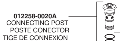
012258-0020A CONNECTING POST POSTE CONECTOR TIGE DE CONNEXION